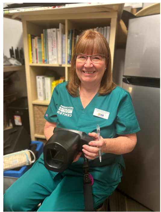
The Vision Screening Director holds the SPOT Camera.

Our vision screeners offer free, community and on-site vision screenings using the SPOT Photo Screener, a guick, reliable, and non-invasive device that provides immediate results.